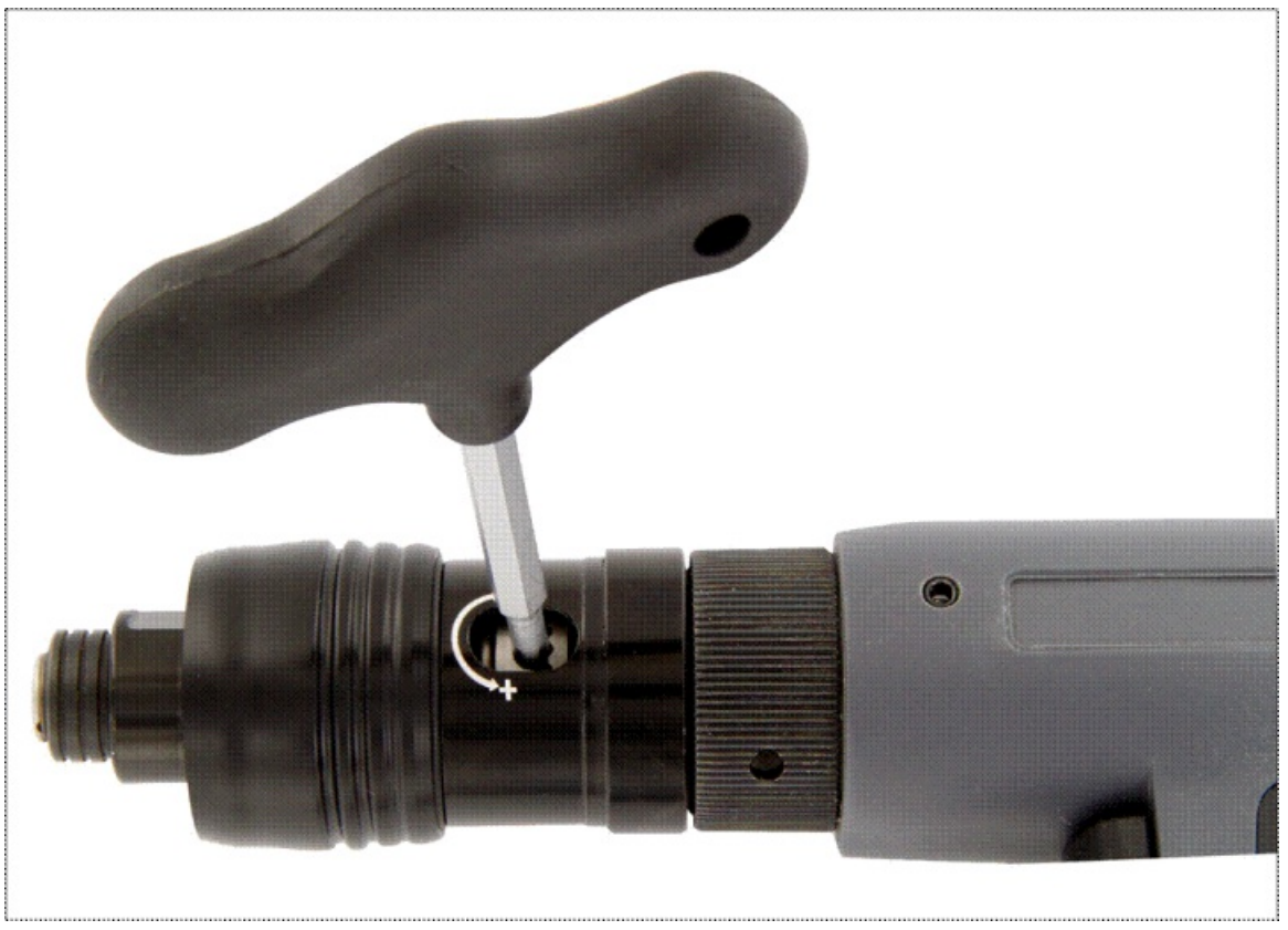
Insert the wrench in the hole.

Rotate the wrench counter clockwise to increase the torque (+). Rotate the wrench clockwise to decrease the torque (-). Video: