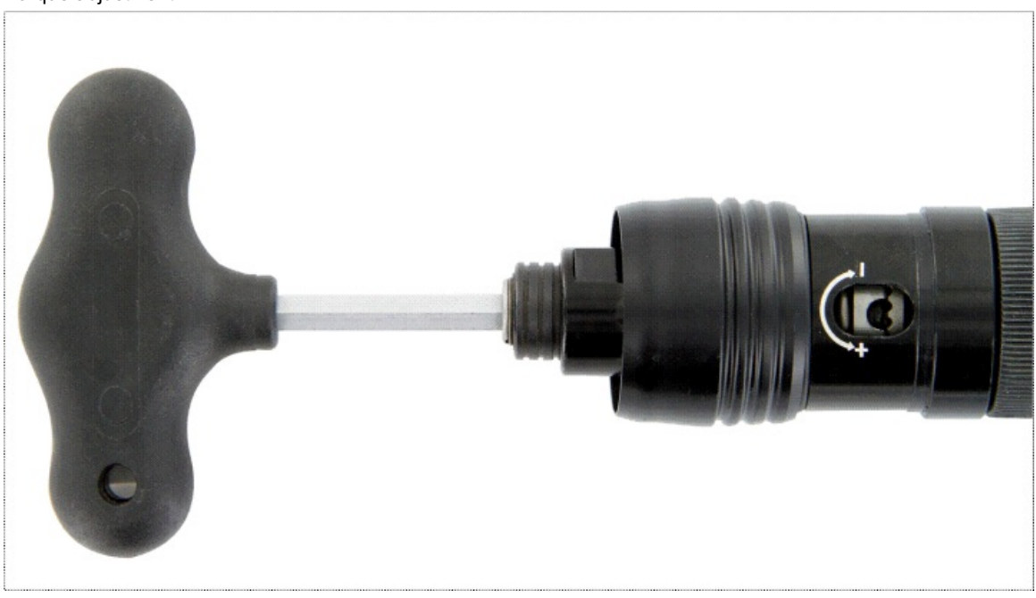
Slide cover to the front.

Use wrench to rotate the shaft until you can see the hole for the wrench.